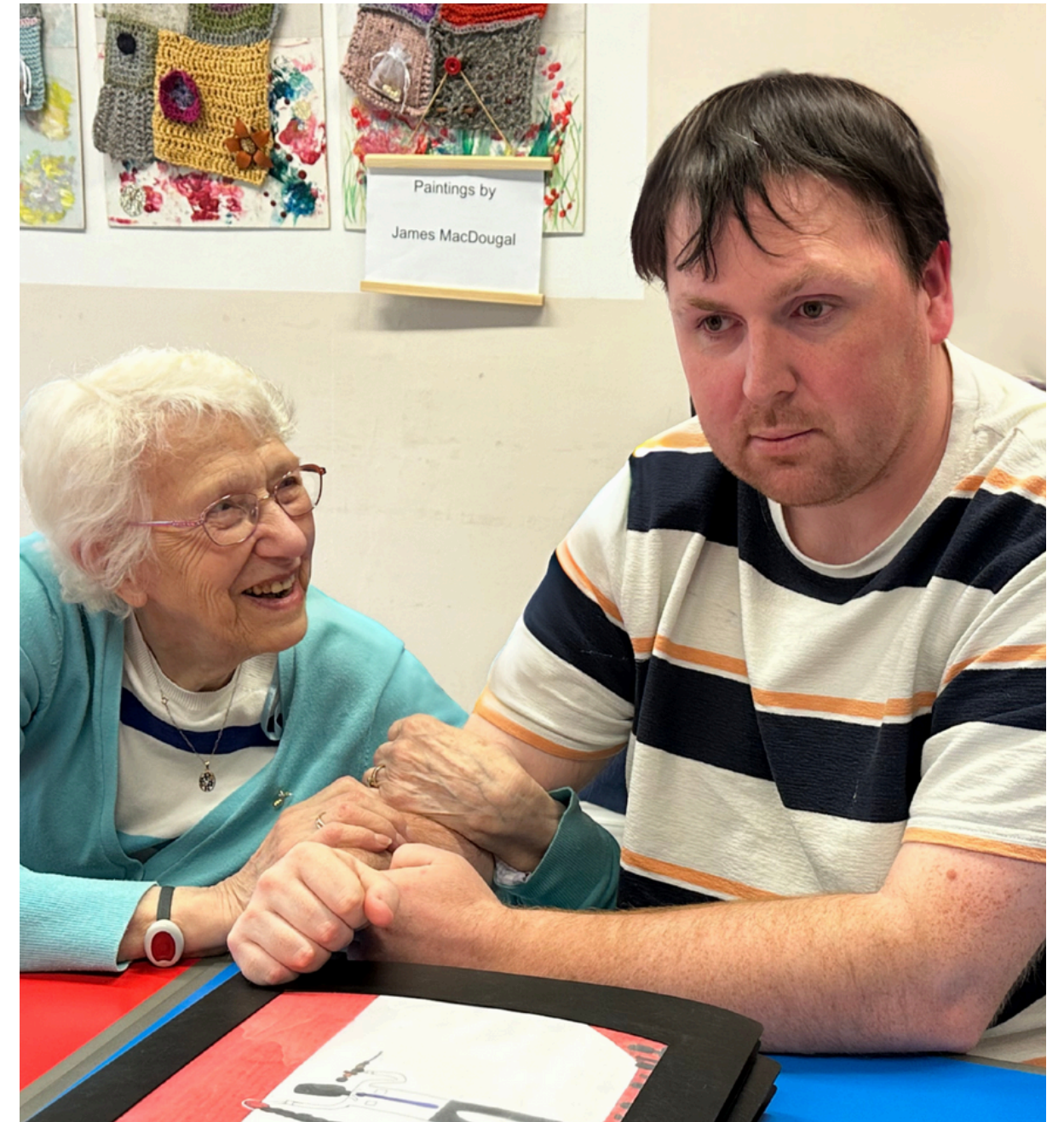
Two Visibility Scotland service users sit together. The person on the left holds the other's arm and smiles.

By year three , our goal is to position the charity as a forward-looking, self-sustaining organisation that delivers meaningful impact while inspiring confidence in all stakeholders.