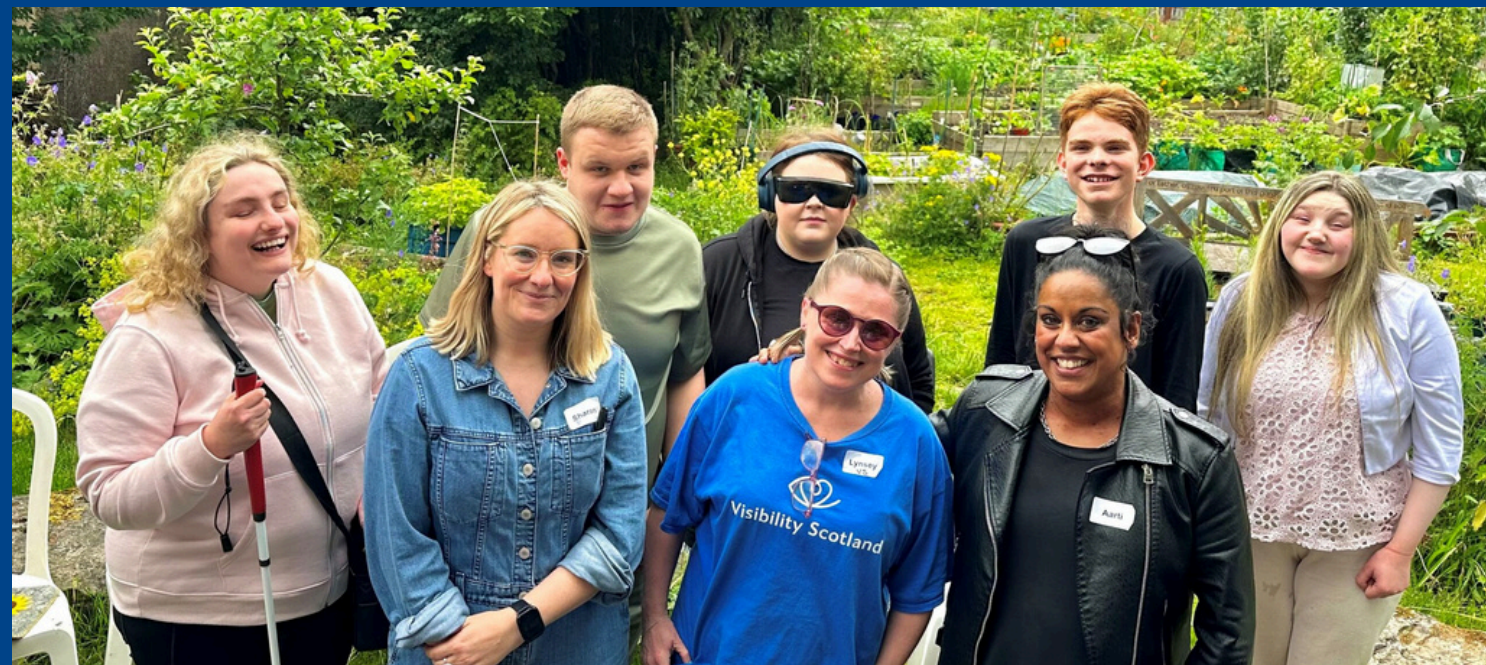
Staff and young people smile together in a garden.

"Visibility Scotland is one of my favourite places to go. Everyone there is friendly, funny and kind. Every time I go, I forget all my worries and just have fun."