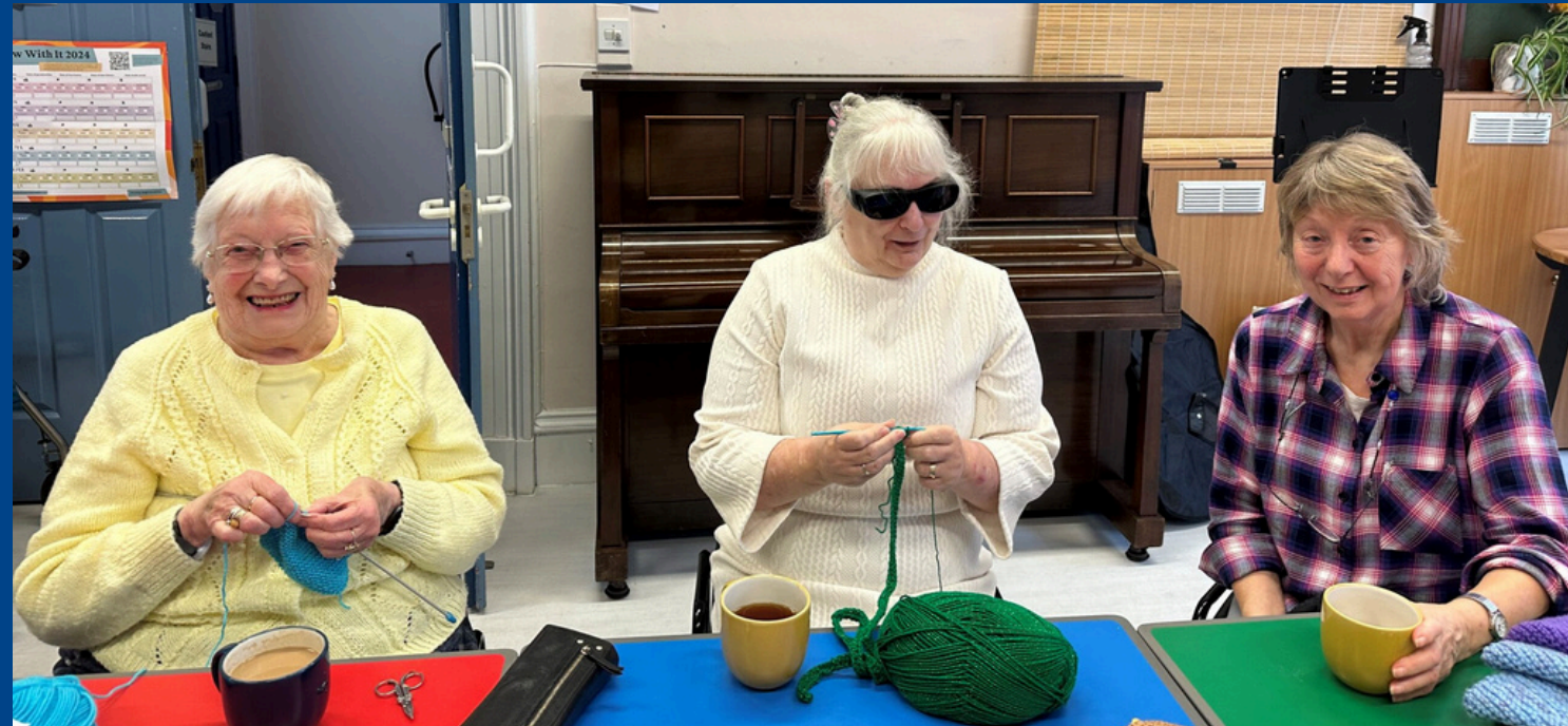
Three craft group members sit together, knitting and smiling

“The staff are brilliant. You can relax in an environment where you’re understood. I’ve made some real friends.”