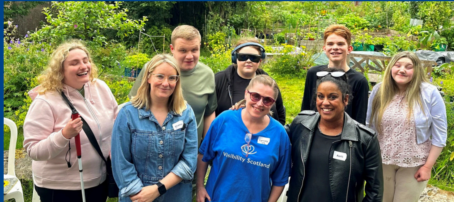
Staff and young people smile together in a garden.

"Visibility Scotland is one of my favourite places to go. Everyone there is friendly, funny and kind. Every time I go, I forget all my worries and just have fun."