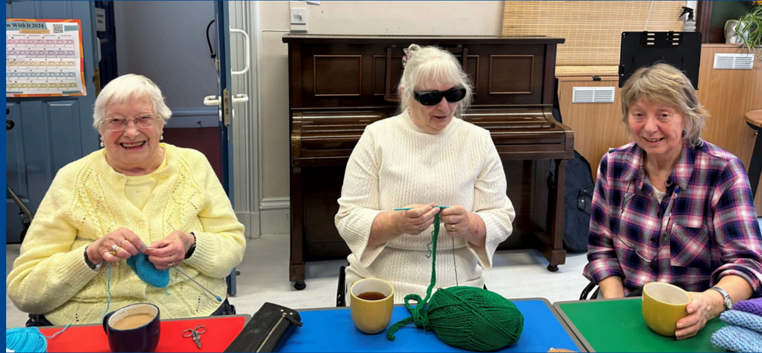
Three craft group members sit together, knitting and smiling

“The staff are brilliant. You can relax in an environment where you’re understood. I’ve made some real friends.”